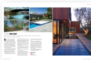
two page spread