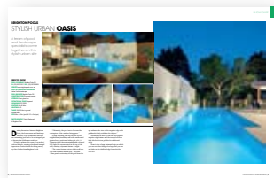
two page spread

Highlighting a host of stunning pools, our Showcase section is an invaluable reference tool where readers who intend to renovate or build a new pool turn to for inspiration and guidance. This is the ideal platform for those in the pool industry to shine the spotlight on their projects.